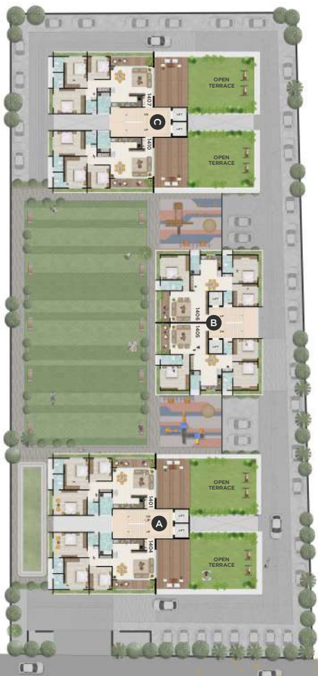
14 th FLOOR