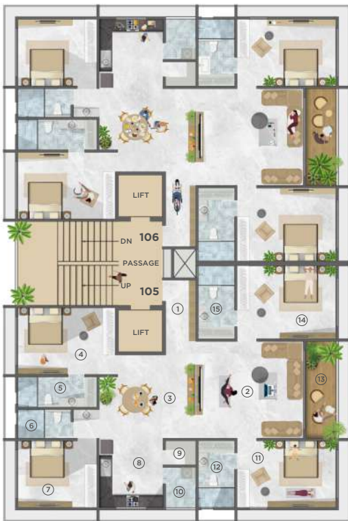
UNIT 105 &amp; 106