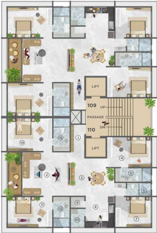
UNIT 109 &amp; 110